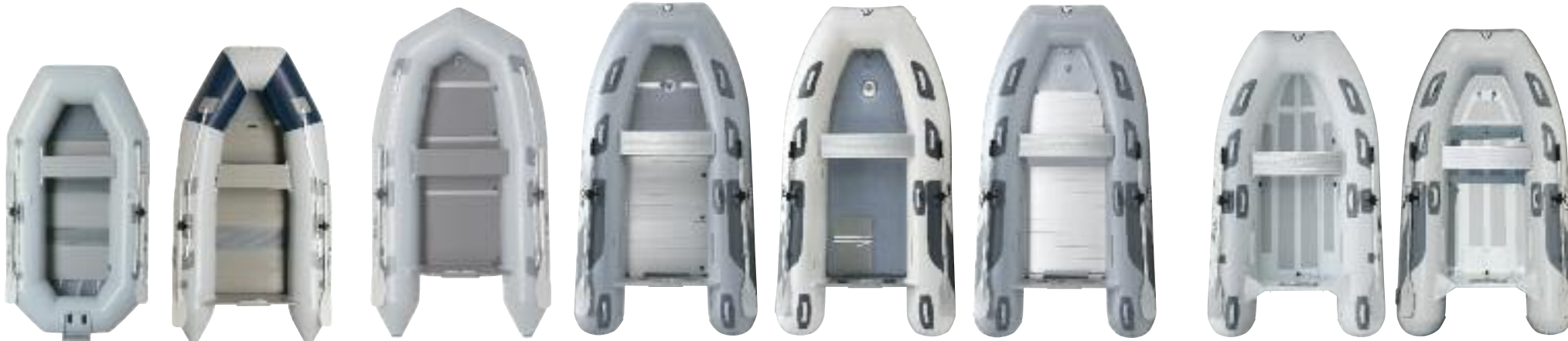
1 LT Series