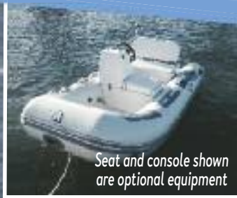
Seat and console shown are optional equipment