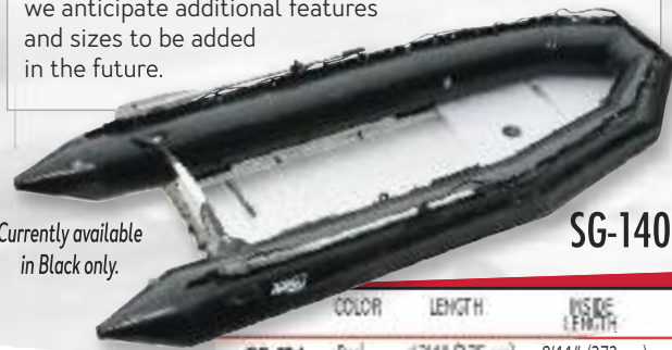
Currently available in Black only.

Our SG-140SV model shares most of the same standard features and specifications as our traditional SG-140 model, but incorporates intercommunicating valves and over-pressure relief valves in all the main air tube chambers. These additions give the end user the ability to inflate the entire boat (except for the keel) from a single inflation point using an SCBA or SCUBA compressed air bottle or tank. It also allows for each chamber to be isolated in the event of damage to one of the chambers. This new inflation system is completely internal so there are no external hoses or hardware to get in the way. Although this is our first offering in the SG-SV series, we anticipate additional features and sizes to be added in the future.