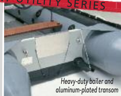
Heavy-duty bailer and aluminum-plated transom