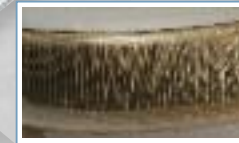
Achilles high-pressure CSM drop-stitch AirFirm™ floors provide superior rigidity.